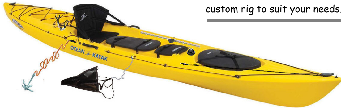
Canoesport Rigged Trident 15 with Stage II Custom Fishing Package